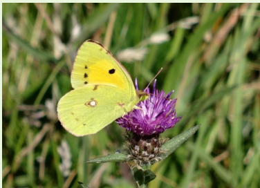
Clouded yellow butterfly